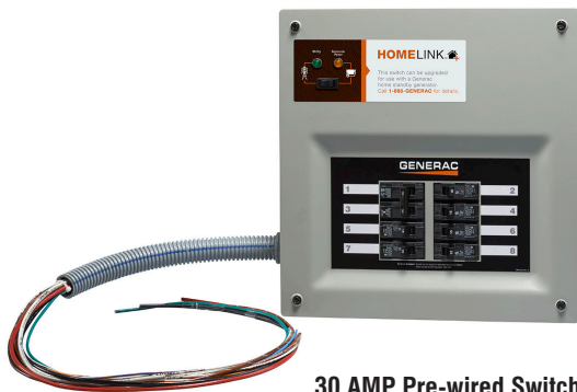
30 AMP Pre-wired Switch Model 6852