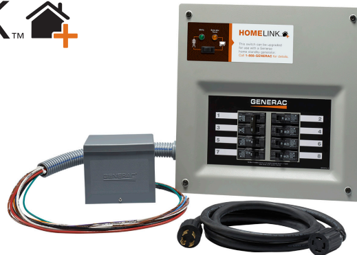
30 AMP Pre-wired Switch Kit Model 6853