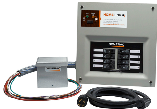
30 AMP Pre-wired Switch Kit Model 6854